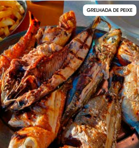
GRELHADA DE PEIXE

Rua Vale das Silvas, 8650-359 Sagres +351 282 625 278