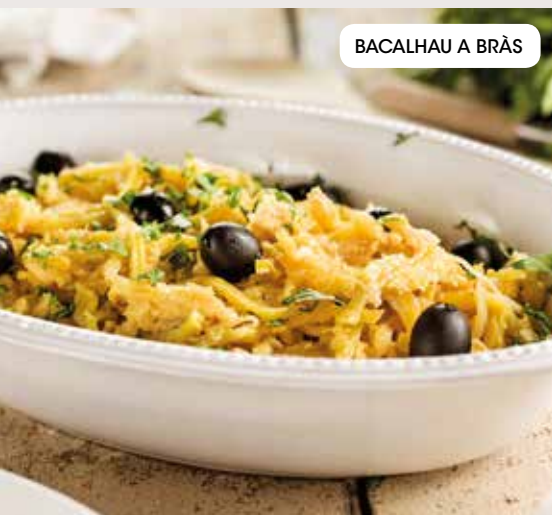
BACALHAU A BRÁS

Praia Carrapateira, Carrapateira +351 282 973 914